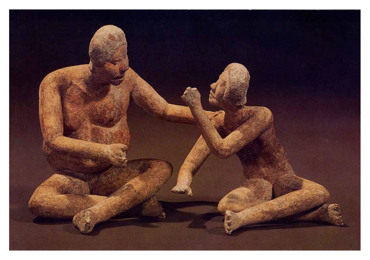
Clay figures of seated youth and shaman, Xochipala, ca. 1500 B.C., Guerrera, Mexico, The Art Museum, Princeton