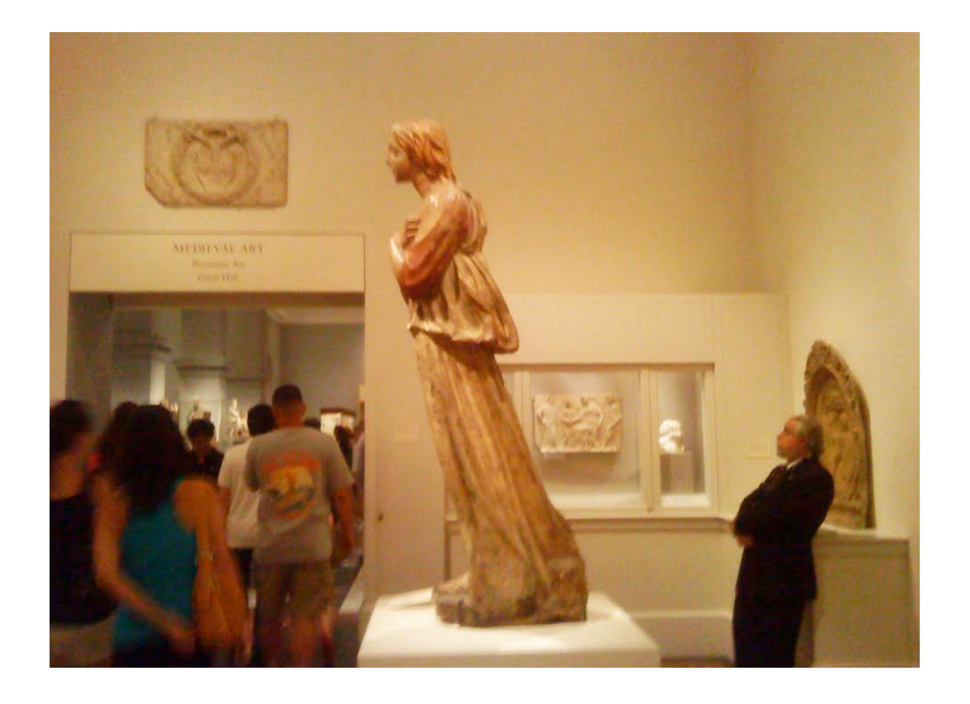
"Fly,' Chamcha shrieked at Gibreel. 'Start flying, now.' And added, without knowing its source, the second command: 'And sing."