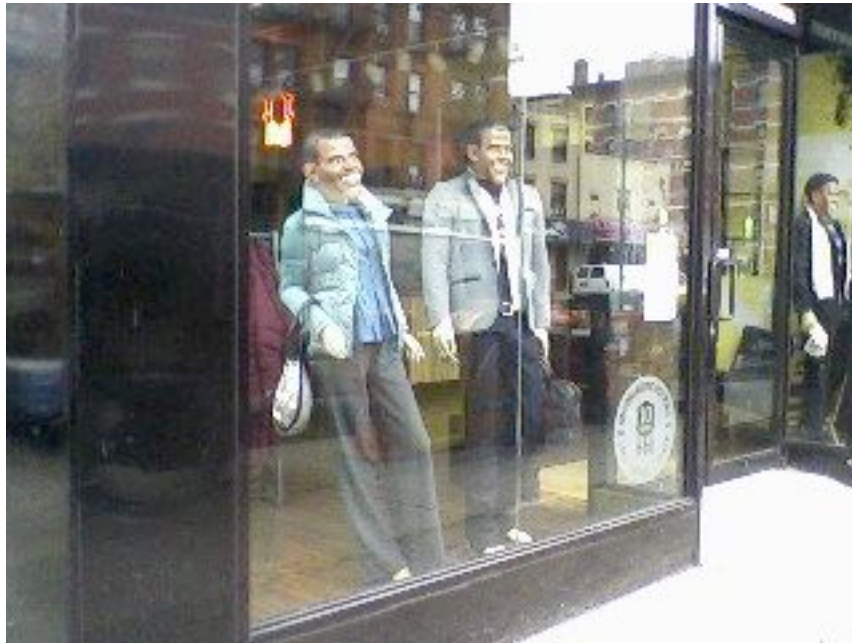
Brooklyn Industries, 18th and Eighth, Isle of Manhattoes.