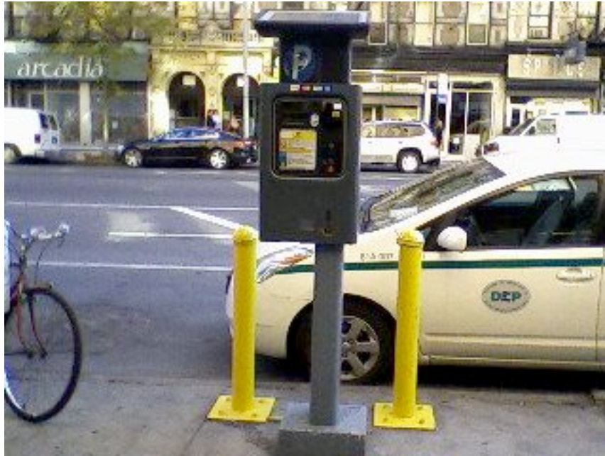
One-legged robot, Eighth between 21st and 22nd, west side.