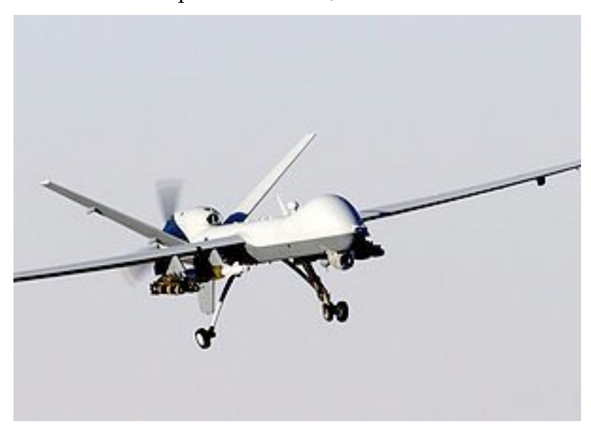
MQ-9 Reaper in Afghanistan

"The MQ-9 is a larger and more capable aircraft than the earlier MQ-1 Predator. It can use MQ-1's ground systems. The MQ-9 has a 950-shaft horsepower-turboprop engine, far more powerful than the Predator's [wimpy] 119 hp (89 kW) piston engine. The increase in power allows the Reaper to carry 15 times more ordnance and cruise at three times the speed of the MQ-1.