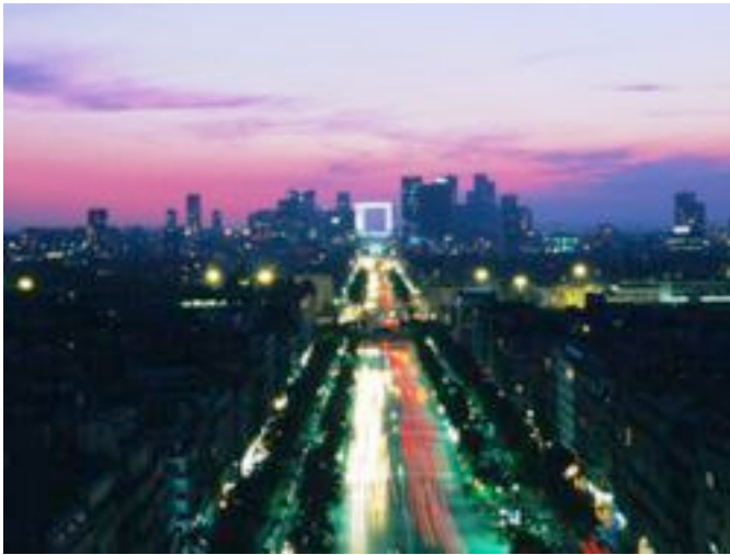
The Grande Arche de La Défense from the top of the Arc de Triomphe.